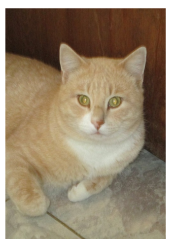
Murray – Adoption pending

Murray and J.P. are both very mellow and total lap cats. They are both neutered and 3 years old. Murray is a big boy at 14# and J.P. isn't far behind. Murray was turned outside when his family got a new Pit Bull puppy. J.P. has been living in Johnstone Park for about a year and he likes dogs. J.P. has gone to Sand Springs to join Logan, another ARF cat.